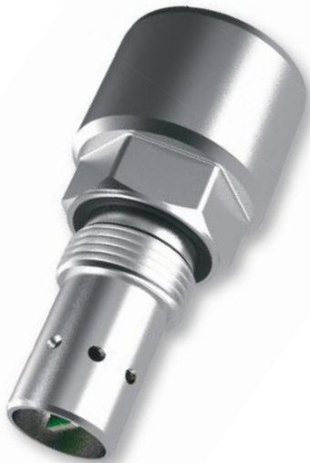
LubCos H 2 O